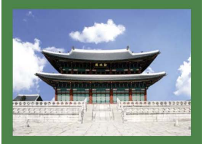
For more details, please visit the website: <u>www.apfis2009.hanyang.ac.kr</u>