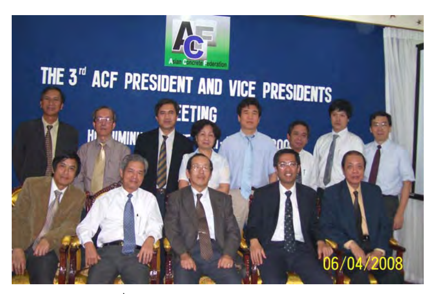
The 3<sup>rd</sup> ACF President and Vice-Presidents Meeting

Attendees also agreed to have a brief inspection tour to check the conference rooms in the Rex Hotel prior to the discussion.