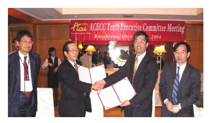
ACF and ACECC agreement (2004)