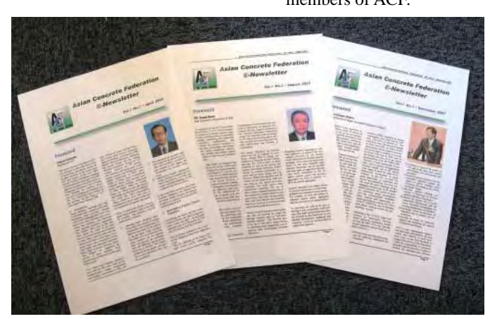
Published e-Newsletters (2007)