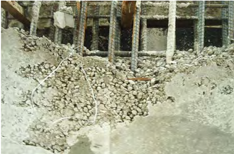
Bad performance of concrete pouring