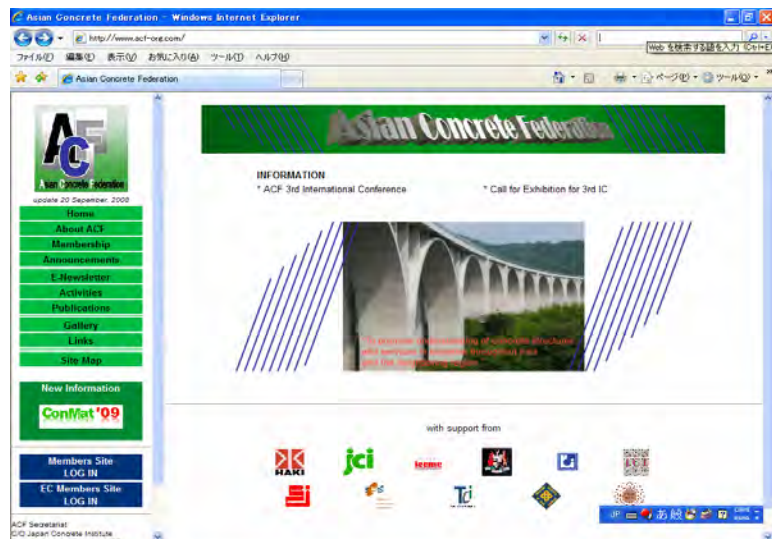
New ACF Homepage

ACF Secretariat sent off the Call for Exhibition for the ACF 3 rd International Conference in Vietnam to all the