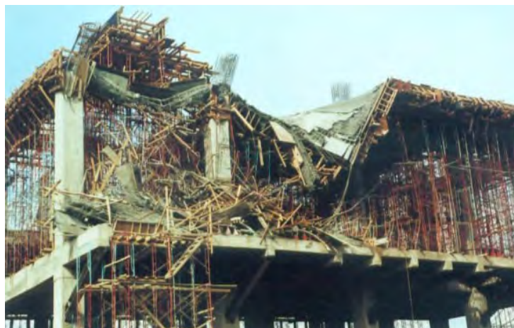
Bad performance of concrete construction