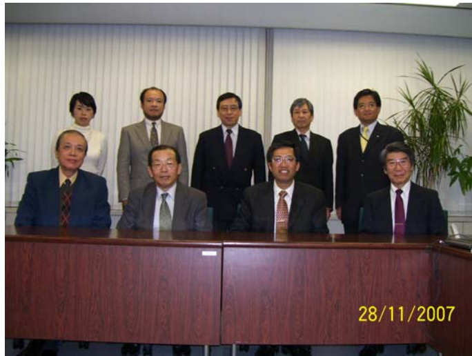
2 nd ACF President and Vice Presidents Meeting in Tokyo

The President adjourned the meeting at 17:15 in the 28 th of November 2007.