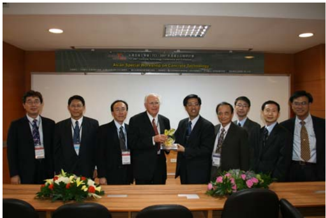
The Asian Special Concrete Workshop to honor Prof. Zdenek P. Bazant's 70 th birthday