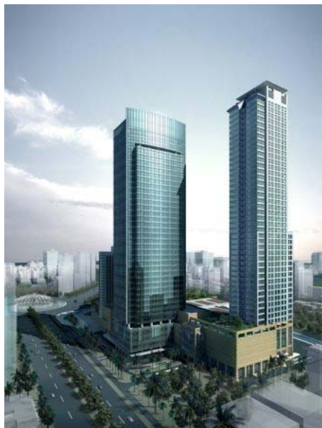
Artist Impression 3D of Grand Hyatt Residence

The contractor for the Plaza Indonesia II is SsangYong Engineering Construction Co. Ltd. Korea, who has appointed the engineering design firm DavySukamta & Partners – Structural Engineers – Jakarta, to work for them. The structural part was tendered on design construct basis.