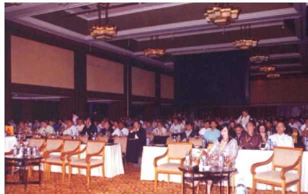
HAKI Annual Conference 2007