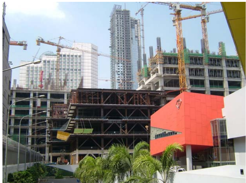
Super-structure in progress