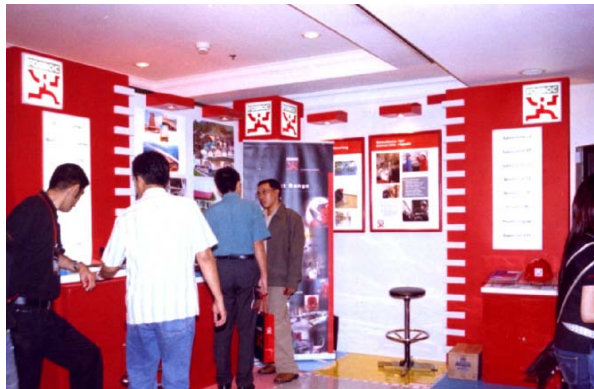
HAKI Exhibition 2007